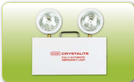
“CRYSTALITE” Cat. CE-8-18S “CRYSTALITE” Cat. CE-5-10N