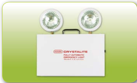
“CRYSTALITE” Cat. CE-12-21S