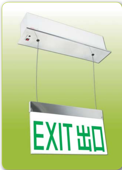
“CRYSTALITE” Cat. CX-LED-405-P-PHL-H Hairline stainless steel finishing cover