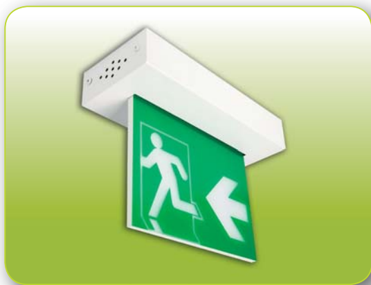
"CRYSTALITE" Cat. CX-LED-220-P-OPL